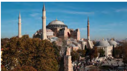
Hagia Sophia Museum

Welcome to Istanbul . View the famous Blue Mosque known for its blue tiles adorning the walls of its interior. Walk around Hippodrome of Constantinople , once the center of Byzantine civic life where horse and chariot races used to take place. Marvel the architecture and beautiful Byzantine mosaics of Hagia Sophia Museum . Take the unforgettable Bosphorus cruise and enjoy the unique experience of cruising between 2 continents, Asia and Europe. Spend some time at Spice Bazaar where the smells of cinnamon, cloves and thyme rise from hundreds of colourful muslin bags at every store front. Overnight in Istanbul.