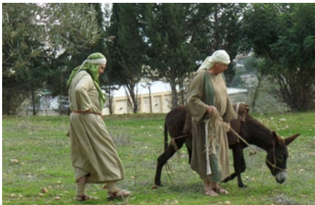
Nazareth Biblical Village