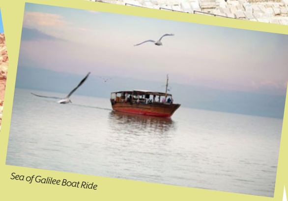
Sea of Galilee Boat Ride